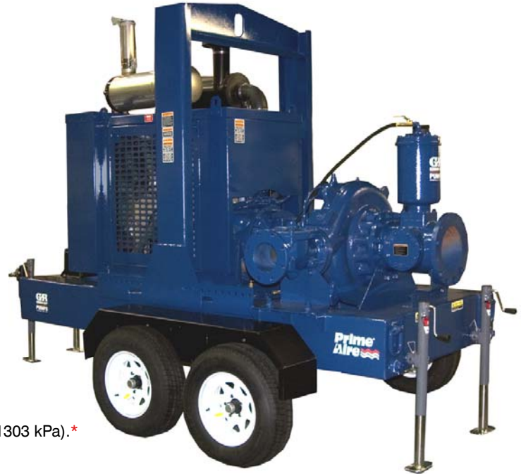
SHOWN w/OPTIONAL WHEEL KIT